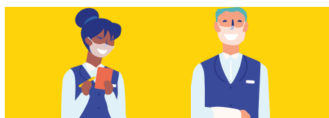
Flexibility in restaurants