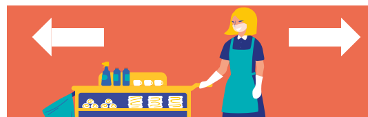
Safety for all and increased hygiene

See all the features directly on the dedicated portal without having to download the app.